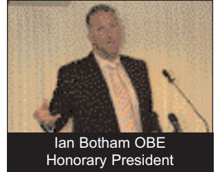
Ian Botham OBE Honorary President

June 15th , our third Parliamentary Reception in the middle of our Raising Awareness Week was considered a highly successful event by MPs and guests with in excess of 70 MPs estimated to have attended. We were elated that our President Ian