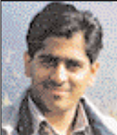
CRY's Research Fellow