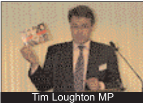
Tim Loughton MP

June 8th , saw an Early Day Motion (EDM 286) on Cardiac Risk in the Young tabled by Tim Loughton MP who was delighted that 127 MP's signed this motion - a similar number to those offering support to giant charities such as Amnesty International and Help the Aged. EDM's are an excellent way of raising the profile of CRY within the House and also assessing how much support there is for our aims.