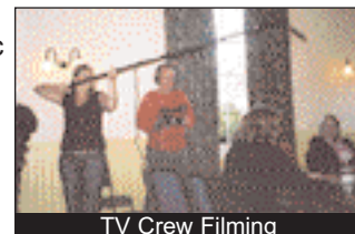
TV Crew Filming

to be shown early in the New Year and will hopefully raise awareness of young people diagnosed with a life threatening cardiac condition, and help promote the support that we offer. The camera crew were excellent, and very sensitive to the stress of the situation, and members of our Surgery Supporters Club were fantastic. As always when outsiders meet them for the first time, they are astonished at their pragmatic approach to life and their concern to help others. Talk of courage always surprises them. They always surprise everyone they meet!