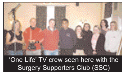
'One Life' TV crew seen here with the Surgery Supporters Club (SSC)