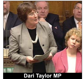
Dari Taylor MP

March 12 found 20 CRY supporters in the Strangers Gallery listening to the excellent debate Dari had orchestrated in the House. This culminated in the announcement by Health Minister Melanie Johnson of the formation of an Expert Group on Arrhythmia and Sudden Cardiac Death that will include CRY in the consultation process for the new chapter to go in the National Service Framework. This offer allowed Dari to withdraw her Bill and was confirmed with a Press Release immediately issued by the Department of Health.