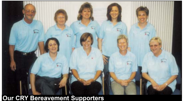
Our CRY Bereavement Supporters

parents, partners, grandparents, siblings and friends who had suffered the loss of a young sudden cardiac death.