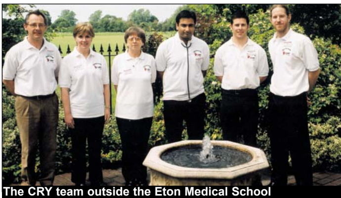
The CRY team outside the Eton Medical School

Our bold decision to have our own CRY funded Research Fellow working in tandem with our screening programme, has already made a significant difference not only to facilitating screening events but also because we now have access to virtually online medical expertise to respond to urgent queries about our conditions and so can offer a very special facility to all those who contact us.