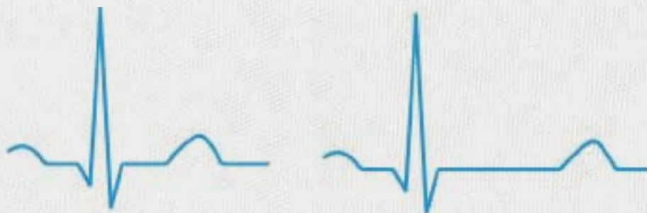
normal QT interval